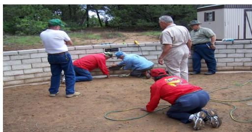
Work weekend at camp— some Indians and lots of Chiefs

So make your plans now to come visit and help us make our Campground a better place to visit & stay.