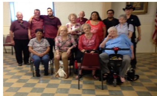
Members of Alamogordo 25

This very active lodge has several more applicants in line to take the degrees and will be planning more Degree days in the future and invites all lodges to bring their candidates to Alamogordo.