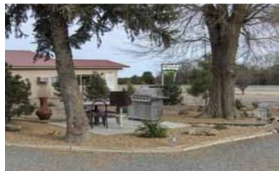
Turner Inn, & RV Park, 303 US HWY 60

The IOOF Recreation belongs to you, the members. If you haven't been there in a while, come to see what you own, enjoy the mountain air, the friendship and fellowship of your brothers and sisters.