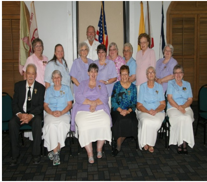
2016 RA Officers