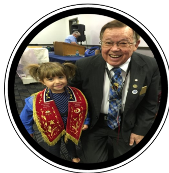
Future Sovereign Grand Master