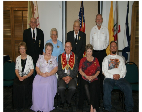
2016 GL Officers