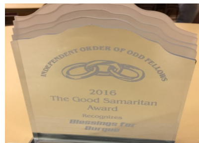
The 2016 Good Samaritan award presented. Accompanied by a check from Harmony